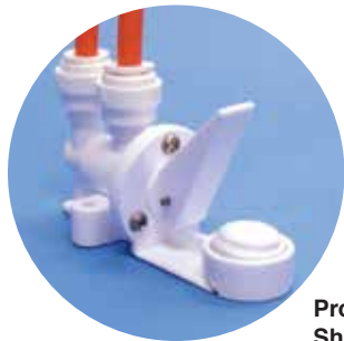
ProTekk Auto-Safety Shut-off valve