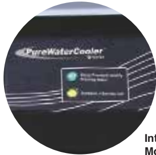
Integrated Filter Monitor